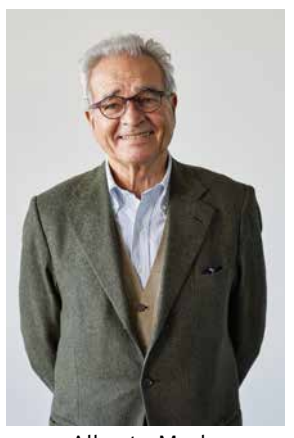
Alberto Meda Launch date: May, 2019 Eyeglasses: 4 Types, 16 Varieties ¥18,000 (+tax)

For further information regarding this press release, please contact: JINS Design Project PR SUPPORT / HOW INC. TEL. 03-5414-6405 /FAX. 03-5414-6406/Mail. pressrelease@how-pr.co.jp