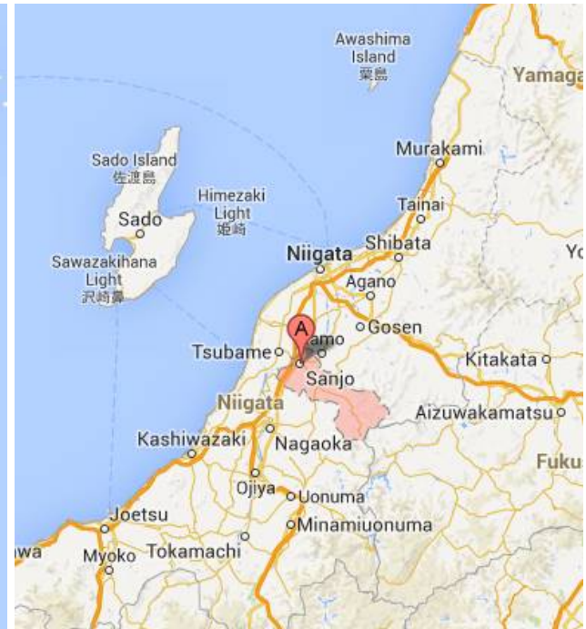
A : Sanjo City