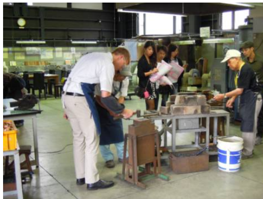
* Factory Festival 2013

Tsubame-Sanjo Factory Festival: http://kouba-fes.jp