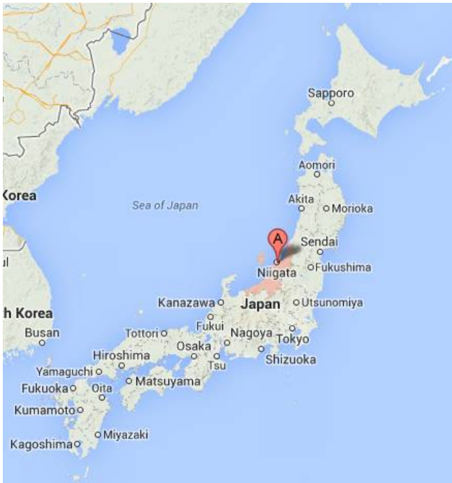
A : Niigata Prefecture

Whilst numerous manufacturers of automobiles, home appliances and heavy construction equipment are concentrated in industrial areas along the Pacific coast, Niigata, located on the other side of the country, has many small factories who continue their traditional artisanship. Out of the 215 traditional crafts officially recognized by the Japanese government, 16 are based in Niigata, which results in the second largest population of artisans in the country.